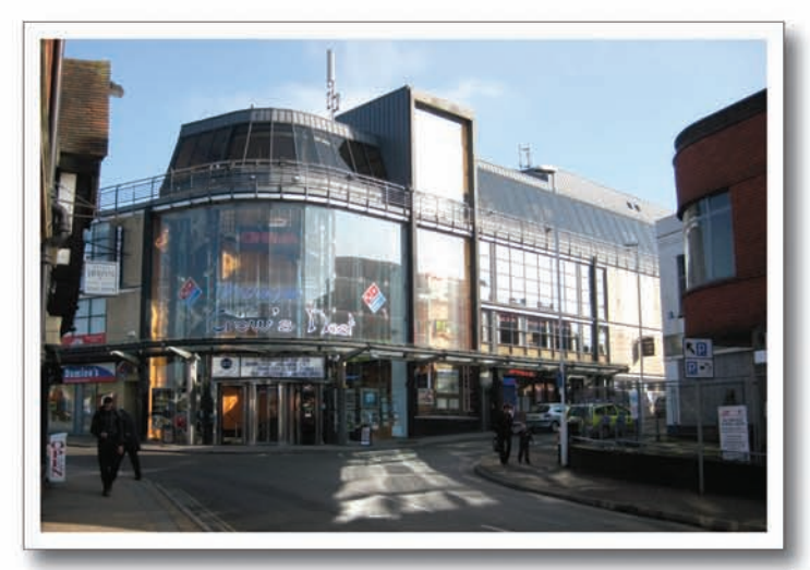
East Grinstead Leisure Complex

Aerial view of Brackla Shopping Centre, Bridgend, South Wales